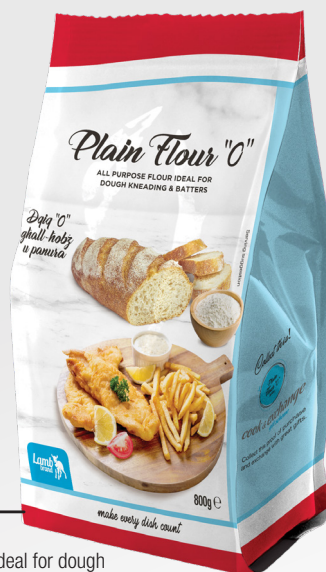
all purpose flour, ideal for dough kneading, batters and bread baking