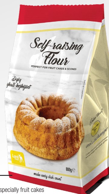
ideal for cakes, especially fruit cakes