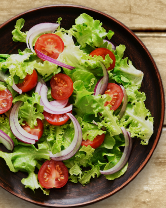
MEDITERRANEAN ROASTED VEG.