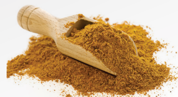
MILD / HOT CURRY POWDER