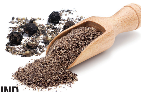
GROUND BLACK PEPPER