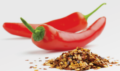
CRUSHED HOT CHILLI

All Spice Aniseed Caraway Cardamom Cayenne Chilli Chinese 5 Spice Cinnamon Cloves Coriander Cumin Curry Fennel Fenugreek Garam Masala Ginger Mixed Spice Mustard Nutmeg Paprika Ras El Hanout Saffron Star Anise Tandoori Masala Tikka Masala Turmeric