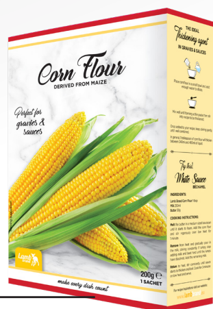
an essential thickening agent