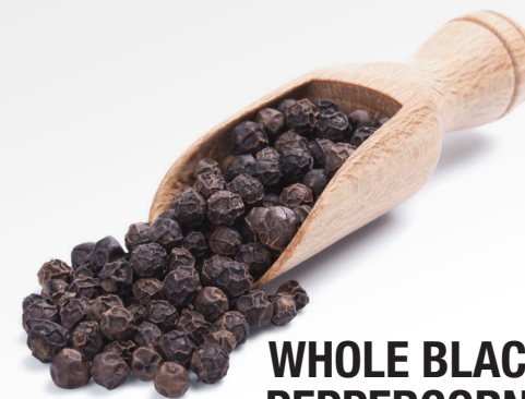
WHOLE BLACK PEPPERCORNS