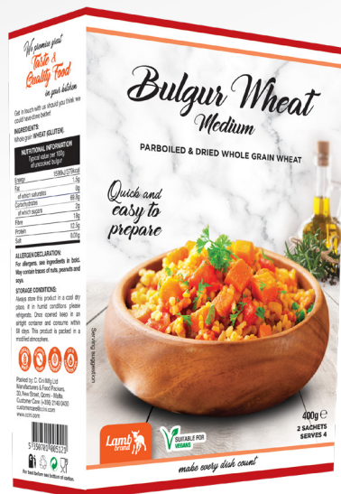
BULGUR WHEAT & BULGUR & QUINOA MIX