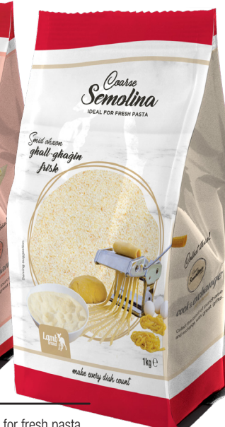
ideal for fresh pasta