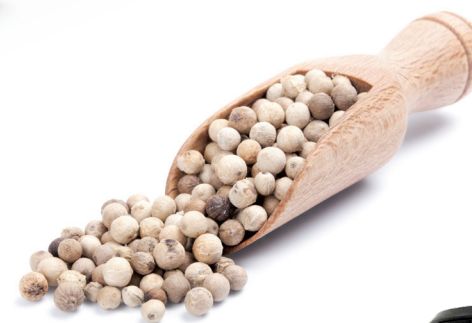
WHOLE WHITE PEPPERCORNS