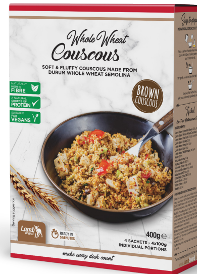
WHOLE WHEAT COUSCOUS