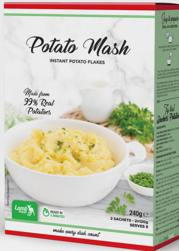
POTATO MASH & POTATO PURÉE