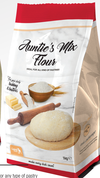
ideal for any type of pastry