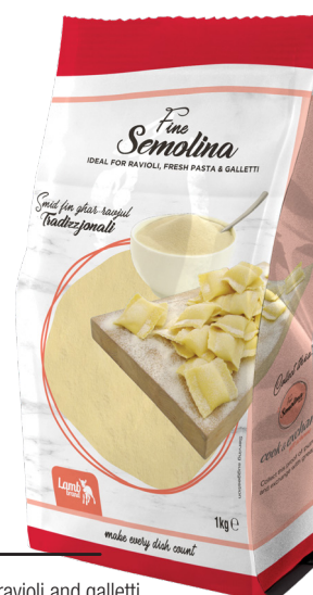
ideal for ravioli and galletti