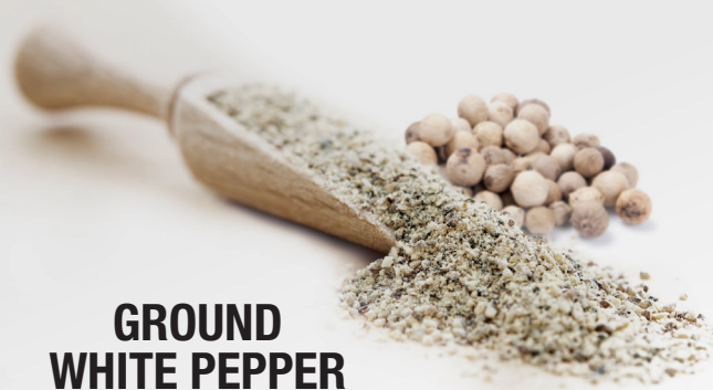
GROUND WHITE PEPPER

Black Crushed Pepper Black Ground Pepper Black Whole Pepper Green Whole Pepper Mixed Whole Pepper Pink Whole Pepper White Ground Pepper White Whole Pepper