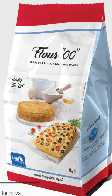
ideal for pizza, focaccia & sponge