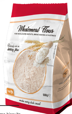
for wholesome biscuits, bread baking and pastries